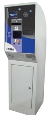
SW-30 Exit Station