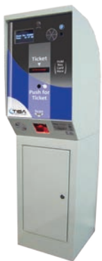
MP-30 Entry Station